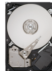
Barracuda ES2 SAS