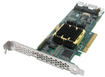
Adaptec RAID 5805 8-port, PCIe, RAID 0, 1, 1E, 5, 5EE, 6, 10, 50, 60