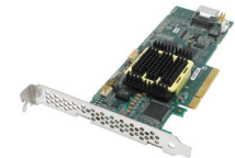
Adaptec RAID 2405 4-port, PCIe, RAID 0, 1, 10 and JBOD