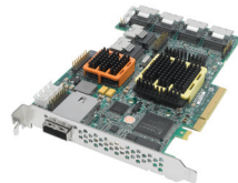
Adaptec RAID 52445 24+4-port, PCIe, RAID 0, 1, 1E, 5, 5EE, 6, 10, 50, 60