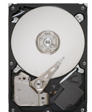
Barracuda ES2 SATA